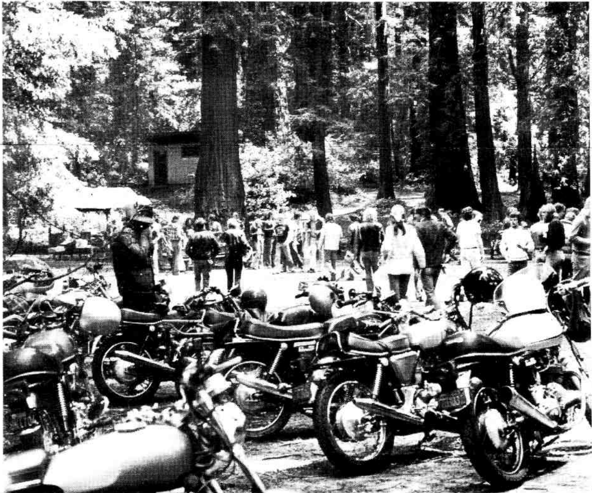
Knee-deep in NORTONS was the rule of the day at the Second Annual Norton Beer Bust

A Publication of the San Francisco Branch