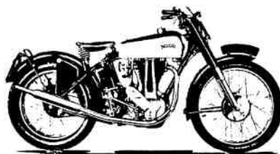
FIRST ANNUAL NOC OFF ROAD RIDE

NOTICE : In the event of rain on the day of a club ride, the ride is automatically postponed one week. Also, riders should have plenty of oil and gasoline by the scheduled departure time and all personal problems should be taken care of. In other words... FULL TANKS AND EMPTY BLADDERS .