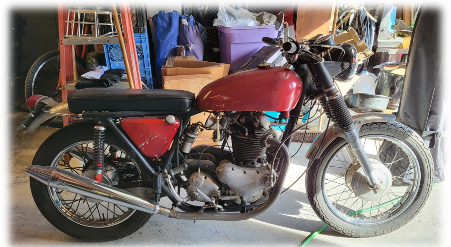
SportsterDiana's new, prone to bursting into flames, 1968 P-11